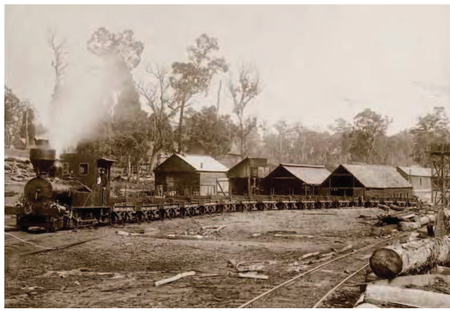
Beyer, Peacock 2-4-0T locomotive SAMSON at Jarrahdale Mill, WA circa 1884-89.