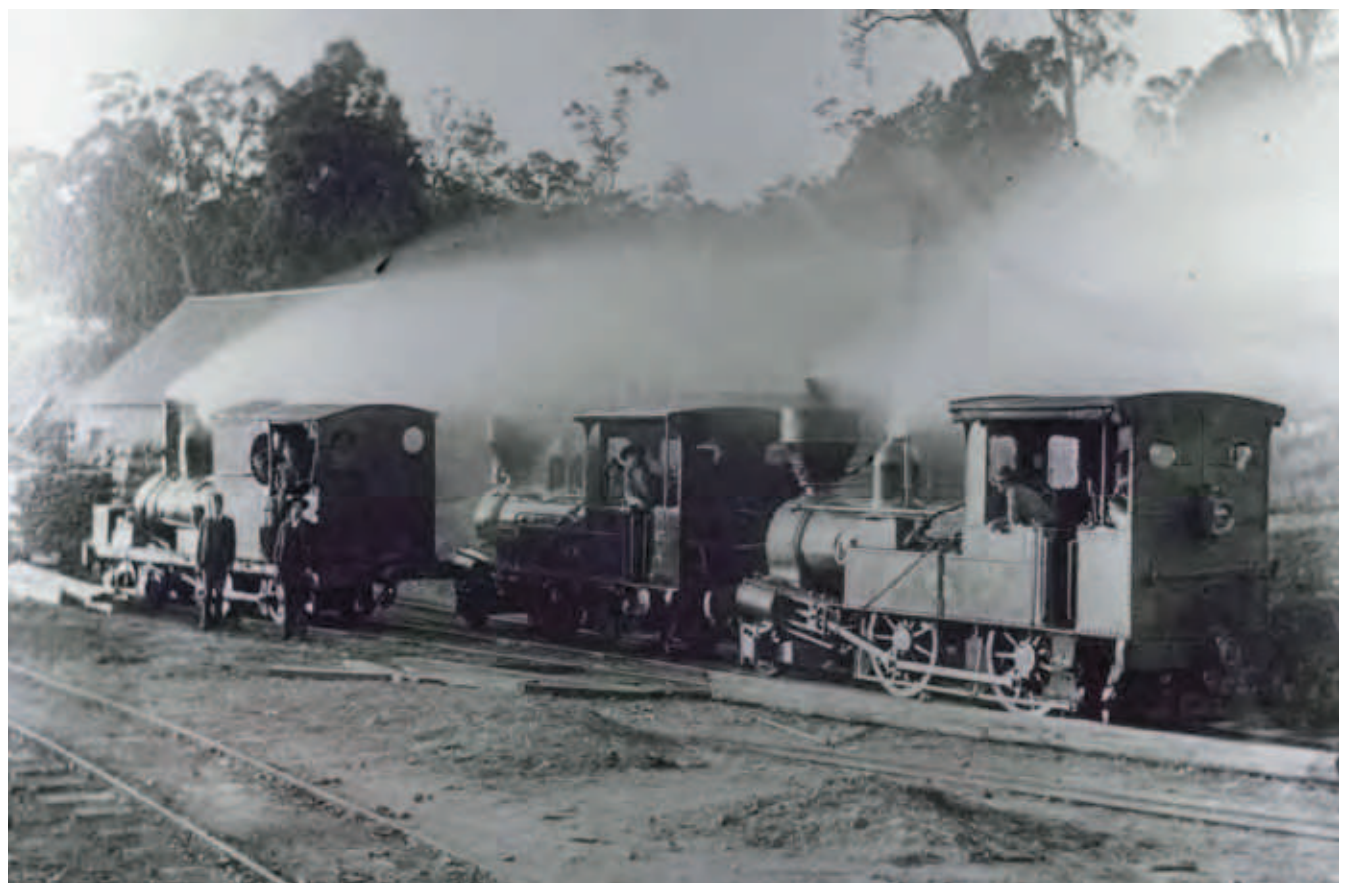
PIONEER (far left) with the two SAMSON locomotives at Jarrahdale Mill, circa 1898.