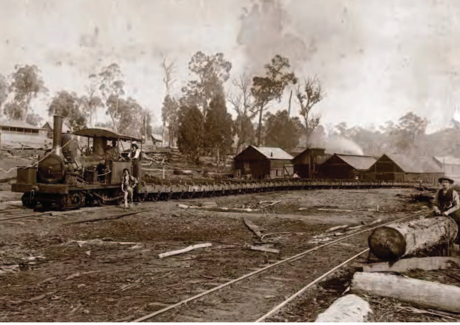
The photograph whose discovery prompted this article. It shows the Fulton Foundry 4-4-0T locomotive PIONEER at Jarrahdale Mill, WA circa 1884-89.