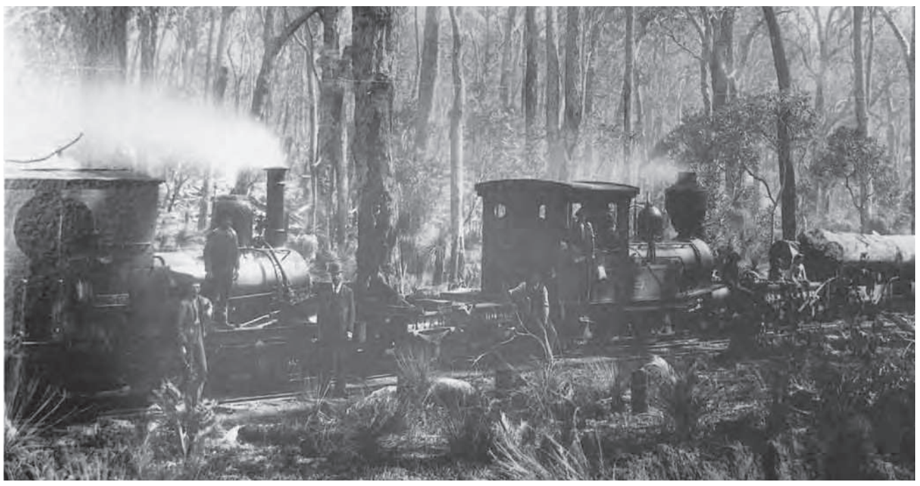
PIONEER (left) double-heading with one of the SAMSON locomotives. Following the fatal accident of 11 June 1890, PIONEER was rebuilt with the enclosed steel cab seen here.