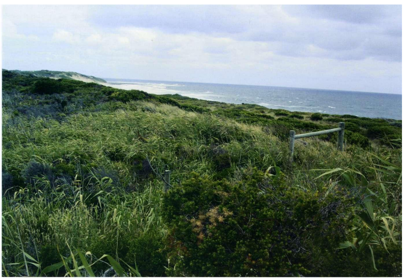
The Victoria Coal Company tramway formation can be seen passing beneath the wooden fence posts to the right of centre and then following into the distance parallel with the shoreline.

was no point in using it given the absence of a substantial pier, at least 400 feet in length, to load the coal into ships at the terminus. Although the company was capitalised to £20,000 it had expended almost all of this in buying equipment, leasing vessels for coal transport, constructing the jetty at the boat harbour, sinking the five shafts and delivering material to Cape Paterson