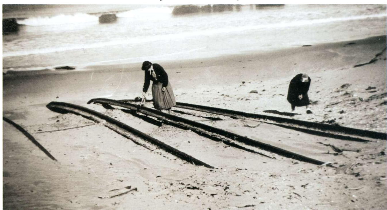
Up to the 1920s, the rails at the proposed terminus on the surf beach at Cape Paterson emerged from the dunes that had covered them over the previous 60 years. They sat in the sand pointing in the direction of the pier that was never built.

At the terminus, the point where the tramway reached the beach is now marked by a shed owned by the Cape Paterson Surf Life Saving Club. Interestingly, beside the shed and protruding from the sand bank are four Barlow rails! The tramway was in a deep cutting and on an incline at this location. However, along with most other cuttings along the way, sand had filled the excavation probably by 1900. The cutting held two sidings in addition to the mainline so was much wider than other cuts along the route. Consequently, a remnant remains in the form of an obvious deformity in the foreshore profile when viewed with your back to the sea, although much of the excavation has filled with sand. When first laid the tramway extended beyond the cutting onto the beach but sometime before 1950 locals removed the rails, again, probably for safety reasons. Recently rails have emerged again as the sand dune has eroded back from the shoreline. A tantalising thought is the likelihood that a set of Barlow rail points remain buried in the dunes near the beach