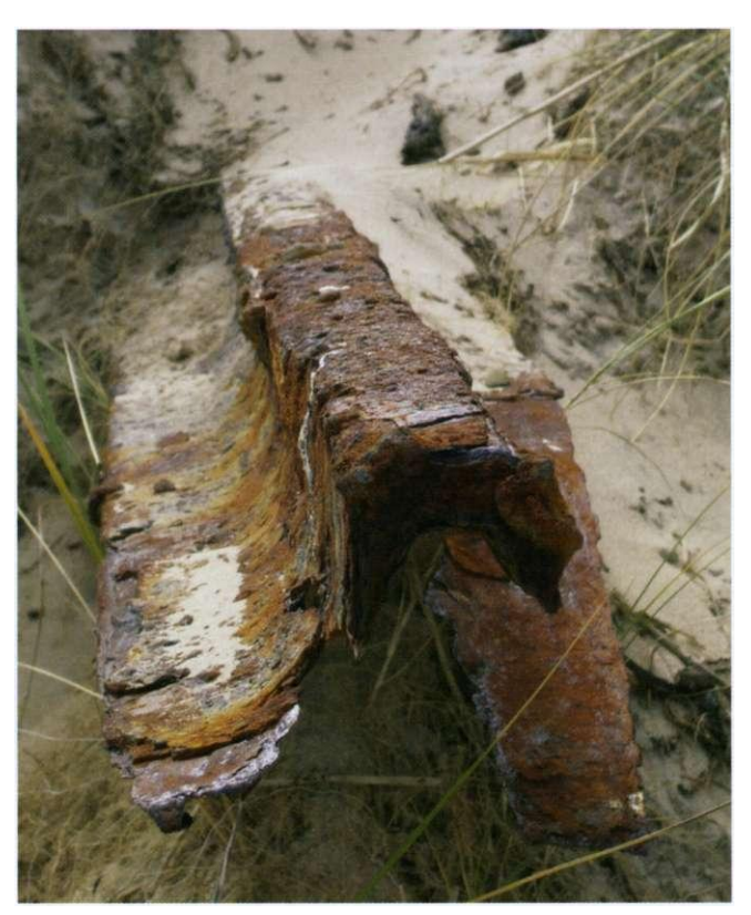
During late 2004 the Barlow rails at the proposed terminus of the Victoria Coal Company's tramway emerged from the dunes on the shoreline after stormy weather. The design of the rails is clearly evident in this photograph. The hollow centre of the rail was intended to be bedded within gravel to maintain stability.

The rails provided were mostly Barlow rails lifted from the Melbourne to Geelong railway and from the Geelong sidings. In all probability, they were the original rails used on that line. They were mostly 73 pounds per yard in weight and measured 10.5 inches across the base, 2.5 inches wide on top and stood 4.5 inches high. They came in 20 feet sections. Included with them were 12 sets of points and crossings, all Barlow rail, that had been 'thrown out in the Geelong yard', for which the Railways Department demanded £4 per ton, and 6500 to 7000 'rivets' for use with the rail. Included were also some 'T' section rails.