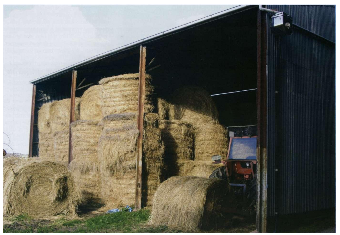
In the 1940s an enterprising farmer saw opportunity in the rails lying along the tramway formation and extracted approximately 12 lengths to use to build farm structures. A shed was built using the rails as upright supports and it remains in use today with the Barlow rails clearly evident at the front.

terminus. It is also likely that rails remain deep within the dunes above the beach along the route, as, over the years, scavengers have recovered only those visible. However, what is visible does change. A local farmer noticed rails protruding from the dunes in the mid-1940s. They had gradually emerged as the dune shifted. He attached a chain to the rails, hauled them clear of the sand, and eventually collected ten lengths to use as poles to construct a shed. In 2005, the shed was still in use with the rails in good condition.