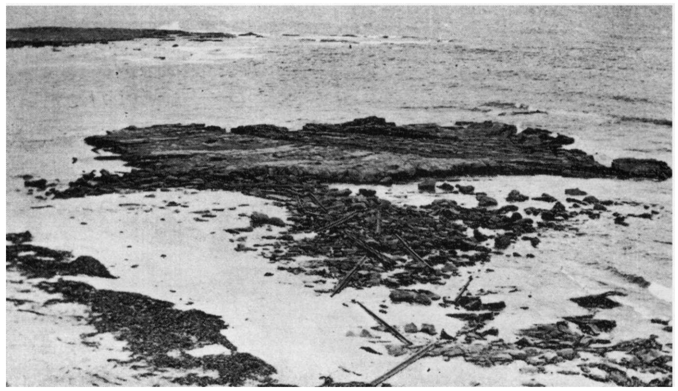
The Victoria Coal Company constructed a short length of tramway across the rock platform and sandy shore at the boat harbour to the east of the proposed terminus at Cape Paterson. Tramway materials were landed at a jetty constructed from the end of the rock platform and were carried over the tramway to firmer ground from where bullock teams hauled the rails and fittings to the railhead. By 2005 virtually all rails had been removed, but in the 1950s they could be found strewn across the shoreline and rock platform as illustrated in this view.