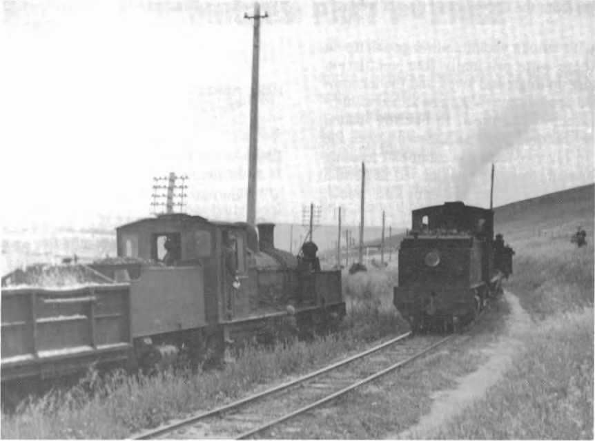
Above: Passing ACL Nos 1 & 2 Garratts at the crossing loop between quarry and works. 1951.