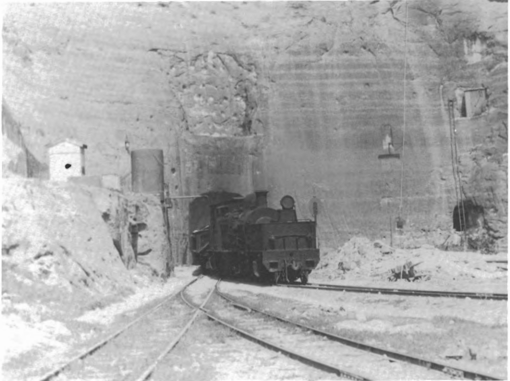
ACL No 1 Garratt emerging from the tunnel into the bed of the limestone quarry. 1951.

Haulage ropes, 260 metres in length, pulled the wagons to the crusher hopper and a hoist tipped the side-opening wagons. The first crane, operating length-wise above the entire yard, was of 5 cyd (10 tonne) capacity, and worked from 1926 to 1938 before being joined by No 2 of 8 cyd (16 tonne) capacity.