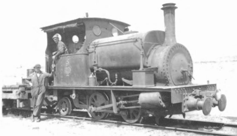
ACL loco No 9 on the overburden tramway at the top of the quarry.

remained in continuous use until the late 1970s. Road cartage of cement up Hyland Street hill was no longer necessary, and in 1922 despatches were 50,000 tonnes over the rail.