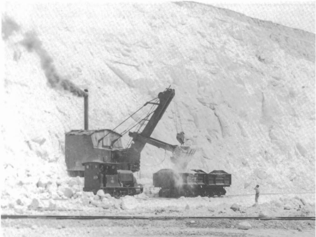
Loading rail hoppers in the limestone quarry. Loco No 5 or 6 (number indistinct) in attendance. 1951.

Finally, the limestone was transported to the works, via the tunnel. The total length of main line was 5.6 km.