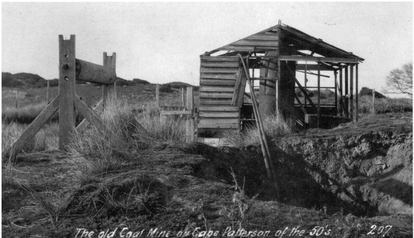
The old Coal Mine on Cape Paterson of the 50's