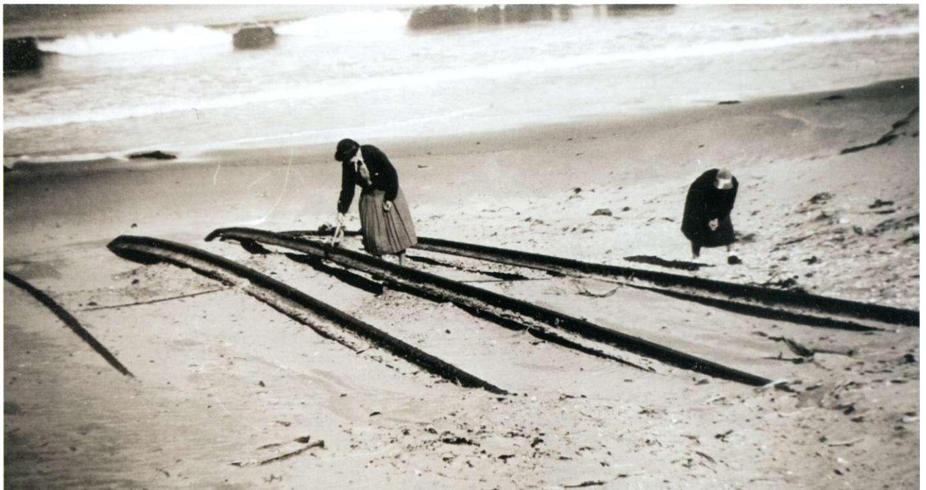
Up to the 1920s, the rails at the proposed terminus on the surf beach at Cape Paterson emerged from the dunes that had covered them over the previous 60 years. They sat in the sand pointing in the direction of the pier that was never built.

At the terminus, the point where the tramway reached the beach is now marked by a shed owned by the Cape Paterson Surf Life Saving Club. Interestingly, beside the shed and protruding from the sand bank are four Barlow rails! The tramway was in a deep cutting and on an incline at this location. However, along with most other cuttings along the way, sand had filled the excavation probably by 1900. The cutting held two sidings in addition to the mainline so was much wider than other cuts along the route. Consequently, a remnant remains in the form of an obvious deformity in the foreshore profile when viewed with your back to the sea, although much of the excavation has filled with sand. When first laid the tramway extended beyond the cutting onto the beach but sometime before 1950 locals removed the rails, again, probably for safety reasons. Recently rails have emerged again as the sand dune has eroded back from the shoreline. A tantalising thought is the likelihood that a set of Barlow rail points remain buried in the dunes near the beach