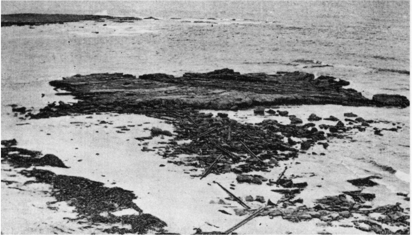
The Victoria Coal Company constructed a short length of tramway across the rock platform and sandy shore at the boat harbour to the east of the proposed terminus at Cape Paterson. Tramway materials were landed at a jetty constructed from the end of the rock platform and were carried over the tramway to firmer ground from where bullock teams hauled the rails and fittings to the railhead. By 2005 virtually all rails had been removed, but in the 1950s they could be found strewn across the shoreline and rock platform as illustrated in this view.