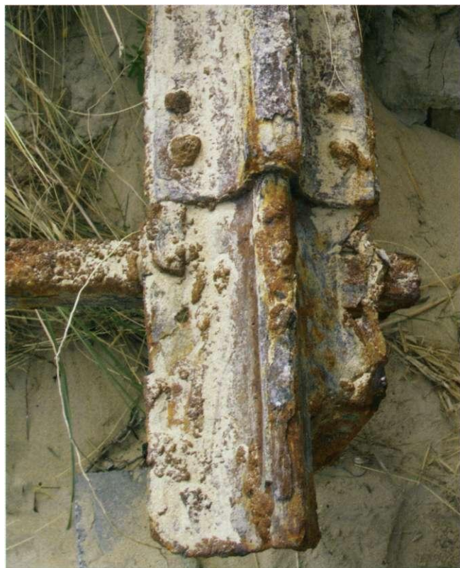
The Barlow rails at Cape Paterson were joined by connection plates. These were 32 inches in length and can be seen protruding from the end of the rail in this photograph.