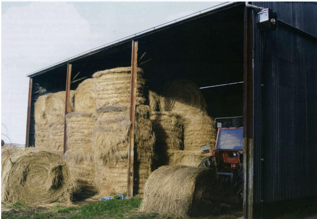
In the 1940s an enterprising farmer saw opportunity in the rails lying along the tramway formation and extracted approximately 12 lengths to use to build farm structures. A shed was built using the rails as upright supports and it remains in use today with the Barlow rails clearly evident at the front.

terminus. It is also likely that rails remain deep within the dunes above the beach along the route, as, over the years, scavengers have recovered only those visible. However, what is visible does change. A local farmer noticed rails protruding from the dunes in the mid-1940s. They had gradually emerged as the dune shifted. He attached a chain to the rails, hauled them clear of the sand, and eventually collected ten lengths to use as poles to construct a shed. In 2005, the shed was still in use with the rails in good condition.