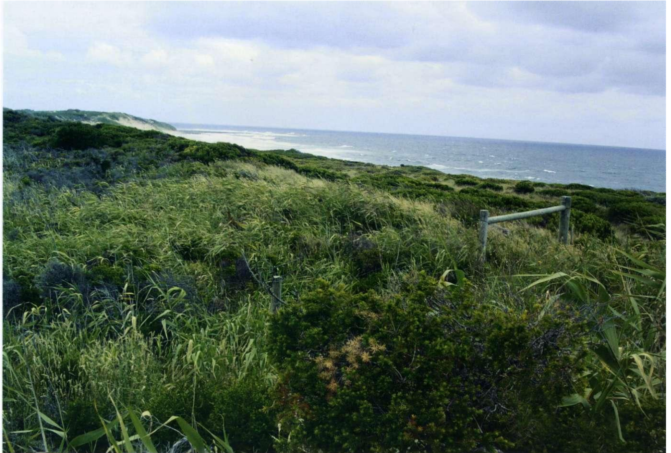
The Victoria Coal Company tramway formation can be seen passing beneath the wooden fence posts to the right of centre and then following into the distance parallel with the shoreline.

was no point in using it given the absence of a substantial pier, at least 400 feet in length, to load the coal into ships at the terminus. Although the company was capitalised to £20,000 it had expended almost all of this in buying equipment, leasing vessels for coal transport, constructing the jetty at the boat harbour, sinking the five shafts and delivering material to Cape Paterson