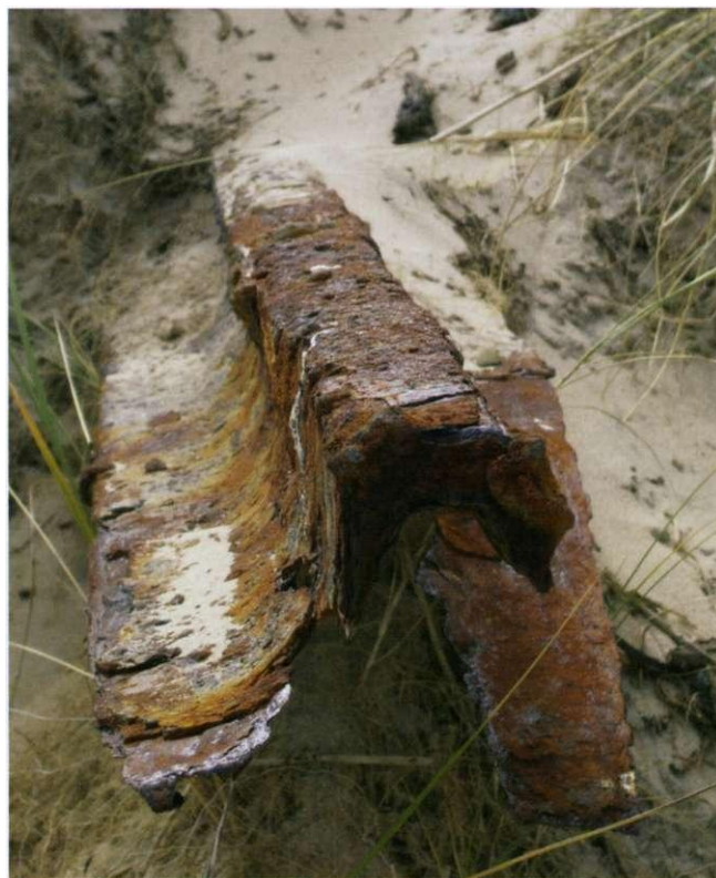
During late 2004 the Barlow rails at the proposed terminus of the Victoria Coal Company's tramway emerged from the dunes on the shoreline after stormy weather. The design of the rails is clearly evident in this photograph. The hollow centre of the rail was intended to be bedded within gravel to maintain stability.

The rails provided were mostly Barlow rails lifted from the Melbourne to Geelong railway and from the Geelong sidings. In all probability, they were the original rails used on that line. They were mostly 73 pounds per yard in weight and measured 10.5 inches across the base, 2.5 inches wide on top and stood 4.5 inches high. They came in 20 feet sections. Included with them were 12 sets of points and crossings, all Barlow rail, that had been 'thrown out in the Geelong yard', for which the Railways Department demanded £4 per ton, and 6500 to 7000 'rivets' for use with the rail. Included were also some 'T' section rails. 18